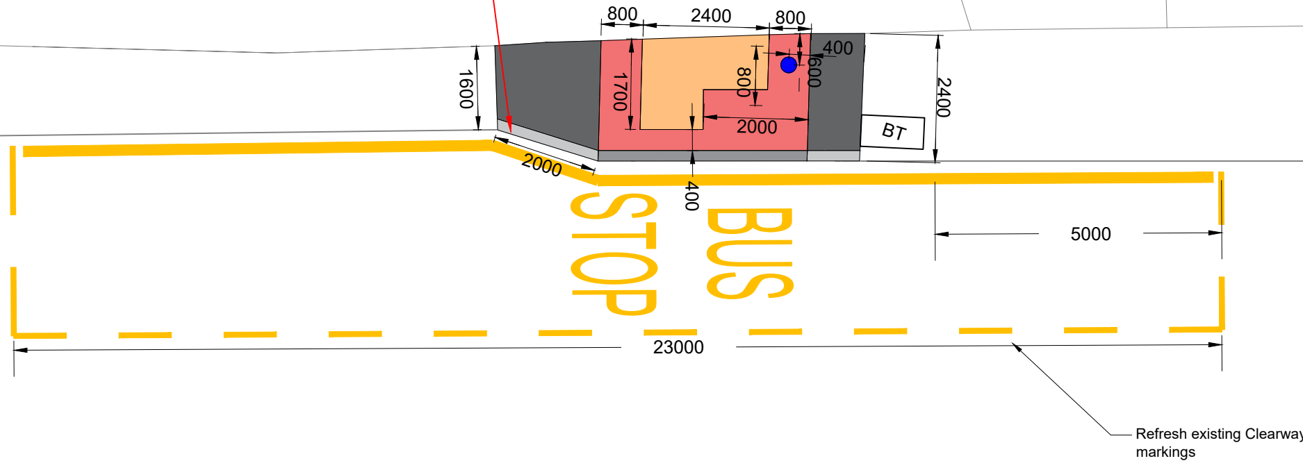
Bus Stop General Arrangement UPBS38